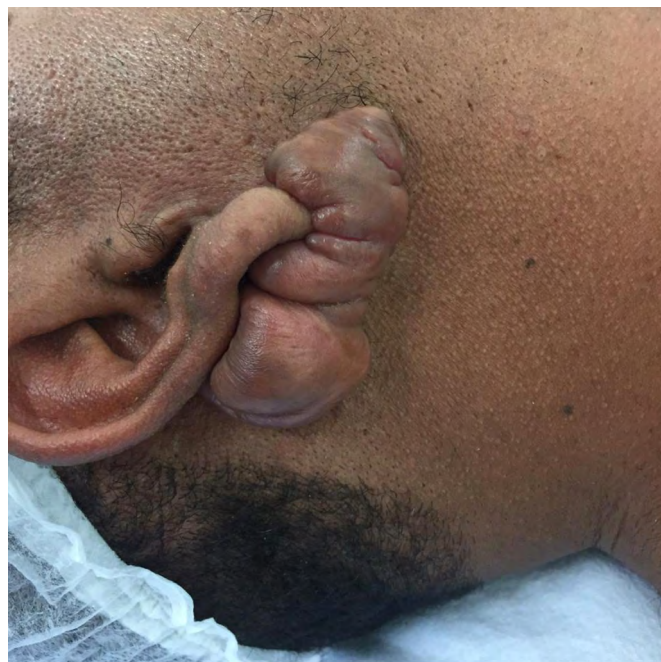
Figure 1. Ear lobe keloid.

The incidence and prevalence of keloids are unknown but affect predominantly young adults. Moreover, the prevalence varies according to race and is higher in Black and Asian populations, but similar between sexes. Keloids have a genetic basis, with