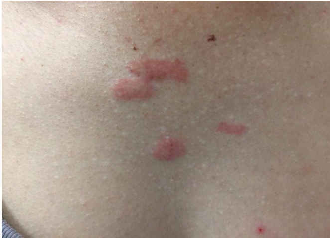
Figure 2. Keloid scar in the pre-sternal region.

an autosomal dominant inheritance of incomplete penetrance and manifest in genetic syndromes 3 .